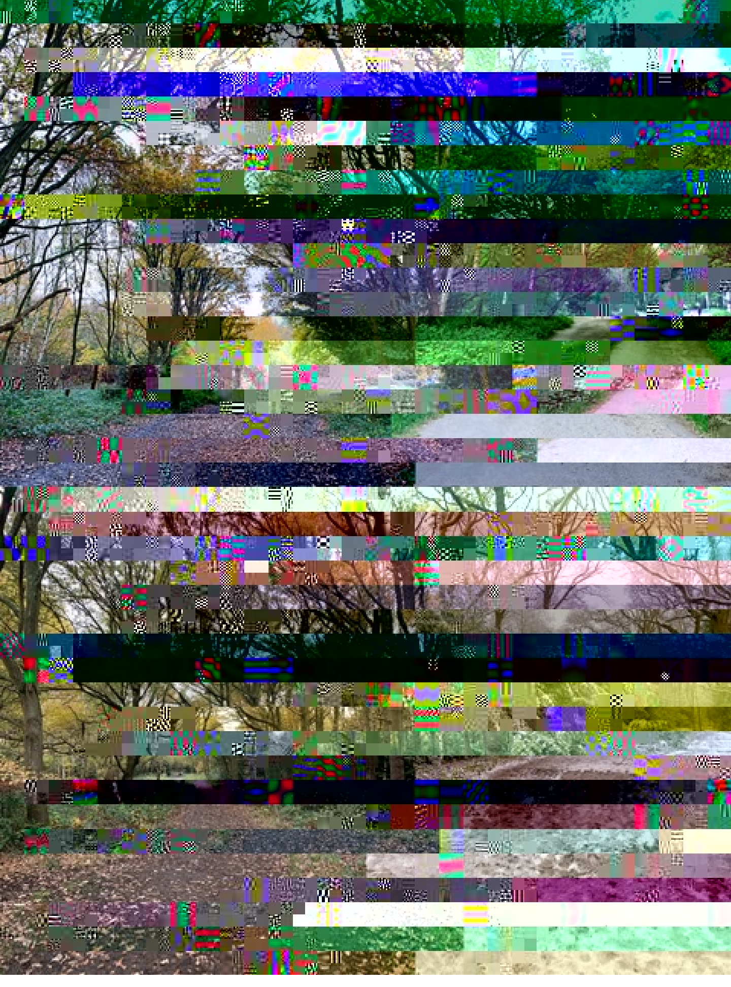
- Light intensity changes within a year

This picture includes 4 seasons: spring, summer, autumn, winter at the same place. The seasonscapture during my PhD research about "light intensity with human vision recept at Wimbledon common (London) from May 2019 until March 2021. We generally think sun changes position in galaxy as the result of changing of earth temperatures. However, we believe that the properties of natural visual images altered by intensity. And it is important to understand them as they describe the properties of natural scenes that ultimately set the parameters of visual processing. For my PhD, I recorded distribution of light intensity and colour changes in natural images using photographic as spectroscopic method. This beautiful pictures prefect reflected the changes of light intensity and also my work through 2 years "light collection" at Wimbledon common.